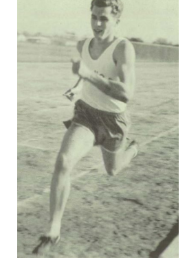
Born: March 5, 1935Boston, MADied: October 4, 2017Lake Forest, CA (82-years old)