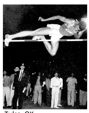
Tulsa, OK Inglewood, CA (66-years old)