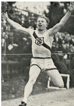
CHARLEY PADDOCK 1916, 1917, 1918 220 champ 12 world records in his career 2 Olympic silver 200m medals