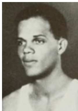
JIMMY LUVALLE 1930, 1931 CIF runnerup 1935 NCAA champion 1936 Olympic bronze medalist