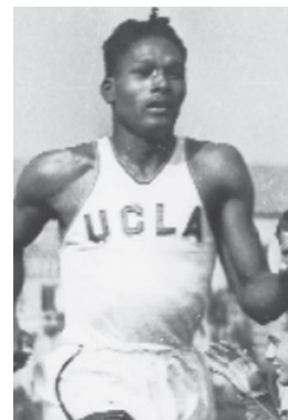
TOM BRADLEY 1935 CIF & LA City champion 1973-93 longest serving Mayor in Los Angeles history