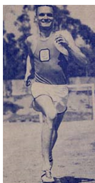
JOHN BARNES 1947 CIF SS runnerup 1952 Olympian 2-time NCAA 880 champ