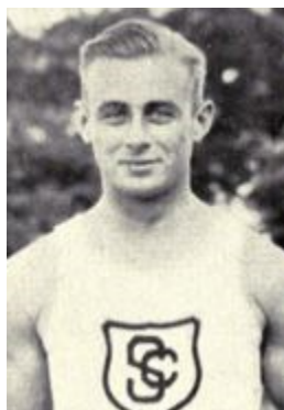
GEORGE SCHILLER 1918 champion 1920 USA Olympian