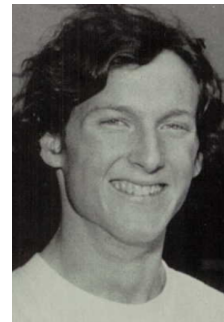
STEVE SCOTT 1974 CIF 3-A 880 champ 1984, 1988 Olympian 1st American under 3:50 in mile