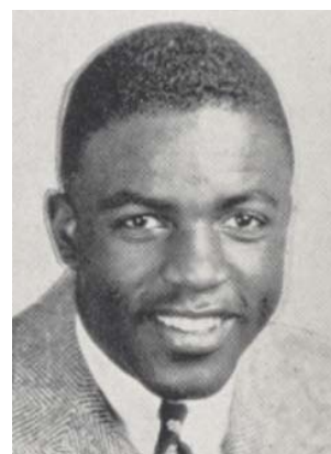
JACKIE ROBINSON 1936 CIF SS LJ champ 1940 NCAA LJ champ Baseball Hall of Fame