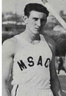
ART SEAGREN Won 1961 EC title. Career best set in 1964 at 15-4 while in Army.