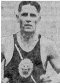
Cecil Howard Compton HS 1925-26