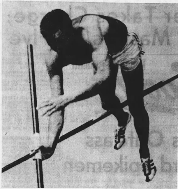
OVER AT 14-8½ —Pomona's Bob Seagren clears 14-8½ to establish a new Chaffey Invitational record. He sailed over the height on his first attempt but failed to clear 15-2½. Seagren was co-holder of previous Chaffey record of 14-1¼.