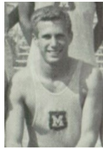
Muir's Mack Robinson went from winning the Foothill League 100 and long jump in 1934 to winning a silver medal in the 1936 Olympics finishing 2nd in the 200-meters at 21.1. Robinson, older brother of Jackie, won the 1938 NCAA 200-meters competing for Oregon.