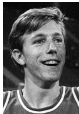
Dwight Stones went on to 1972 and 1976 Olympics and set word record after high school.