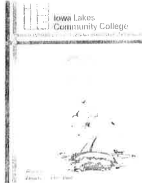
Brochure-Softball Printed or Mimeograph/Ditto Iowa Lakes CC Estherville, Iowa