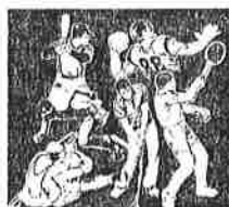
Spring Sports Brochure Printed or Mimeograph/Ditto Mesa CC Mesa, Arizona