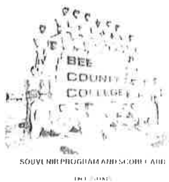
Program-Baseball Printed or Mimeograph/Ditto Bee County College Beville, Texas