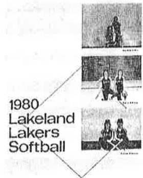
Program-Softball Printed or Mimeograph/Ditto Lakeland CC Mentor, Ohio